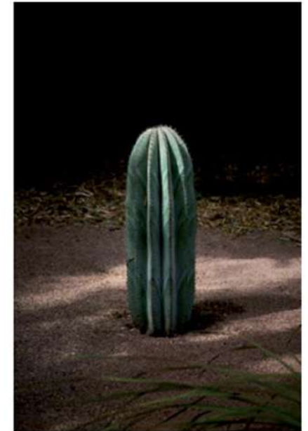
Jardin Majorelle , 2017