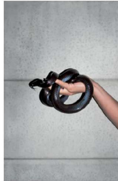
Left: Dancing , 2019. Above: Onix , 2015

Fundamental to her work is the deep sense of discipline revealed through a slow and methodical examination of her subject, which ranges from inanimate object to intimate portrait. She shoots only in available light to highlight the concept of seeing things as they really are, and places comparatively significant emphasis on her curatorial process: "The pairing of images is an important part of my process as it helps me clarify an ideology more clearly. Each image is carefully selected to lead the viewer into a visual narrative, and to build a world of freedom and contentment."