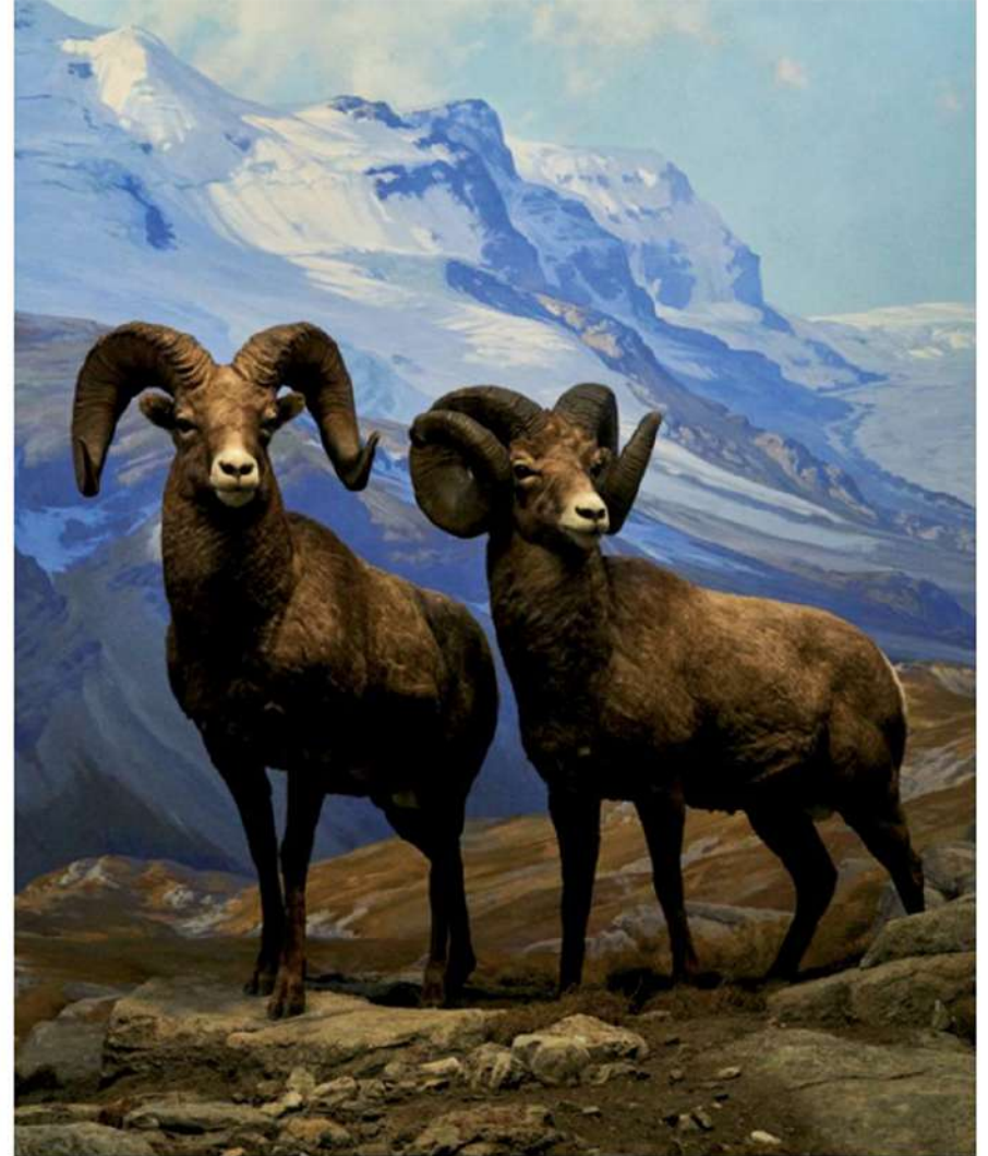
Left: A friend on my couch , 2018. Above: Gemini Capricorn , 2018

The result is a meditation on beauty – a subject captured with focused, isolated simplicity.