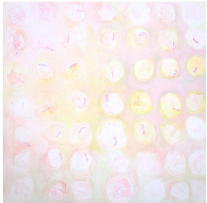
Emily Rae Smith Labuschagne, Flower sponges , 2019